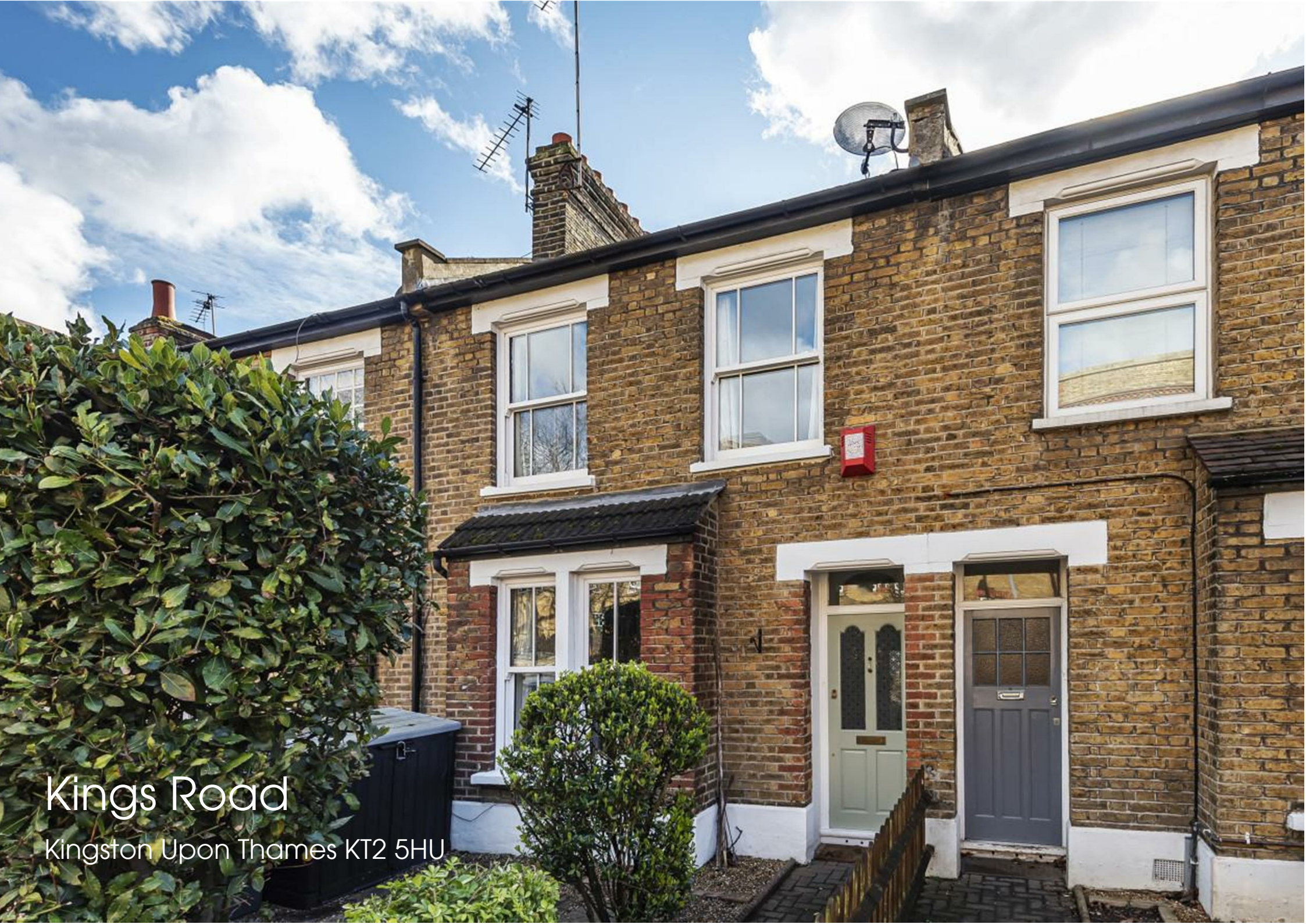
Kings Road Kingston Upon Thames KT2 5HU

34 Richmond Road Kingston upon Thames Surrey KT2 5ED www.gibsonlane.co.uk Tel: 020 8546 5444